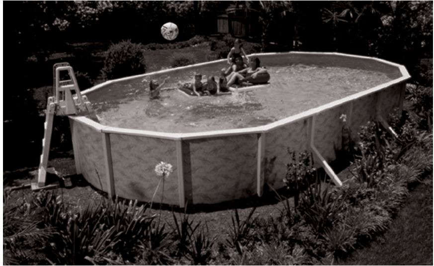
(Not actual pool)